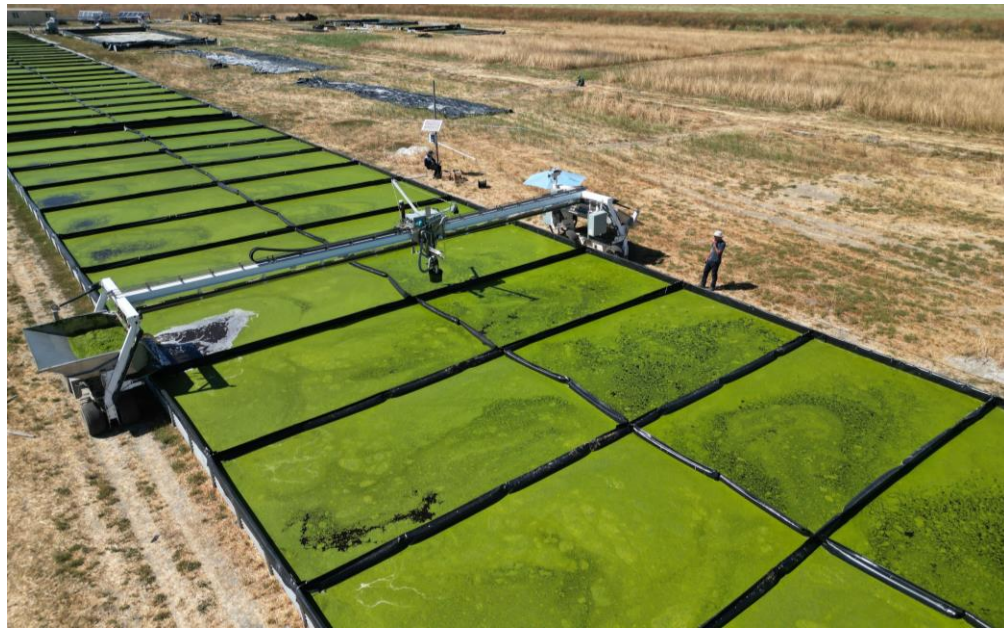
Fyto employee oversees automated aquatic crop harvesting of lemna grown on dairy effluent in 2023.

While some dairies look to grow new feed crops indoors, others are transitioning existing cropland to systems that use effluent and digestate to grow floating plants in lined aquatic rows. In 2023, the California Department of Food and Agriculture (CDFA) awarded $2 million dollars to tech company Fyto for a research demonstration project titled, “Aquatic Crop Production as a Nutrient-to-Feed Solution for California Dairies.” The project aims to boost the State’s innovative manure recycling efforts by growing Lemna , also known as duckweed, for use as a high-protein dairy feed ingredient. Fyto’s aquatic crop platform utilizes multiple times more nutrients per acre than the most efficient land cropping systems, eliminates nutrient leaching, and can reduce the import of nutrient-dense agricultural inputs.